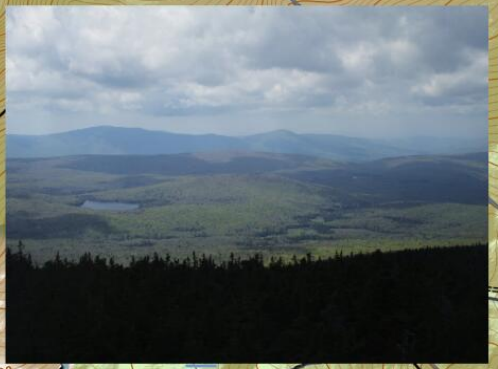
Updated: October 29, 2020 by AndyArthur.org in QGIS 3.16.0-Hannover and Python. Street Map is Copyright © OpenStreetMap contributors, CC BY-SA. USFS Data is from VT GIS. Projection: NAD83 / UTM zone 18N. (WGS84). Contours are 20 feet.